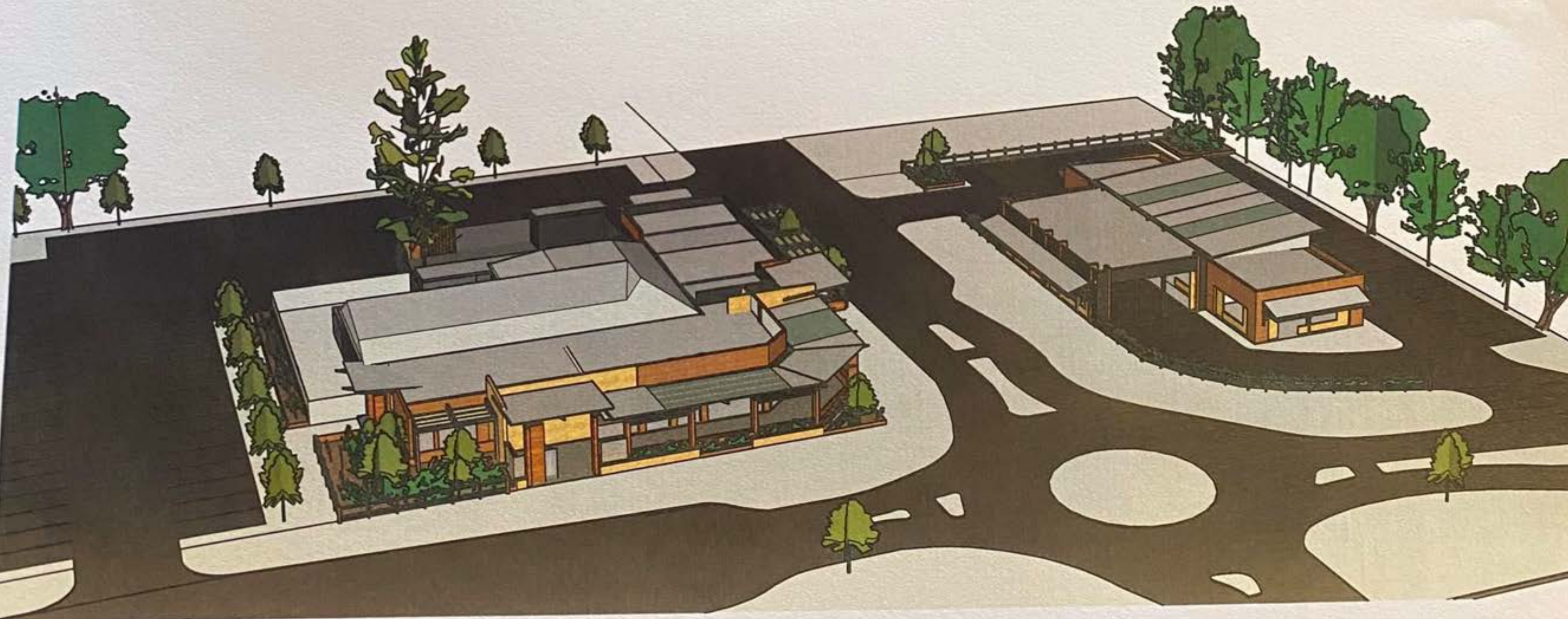
LOOKING NORTH EAST