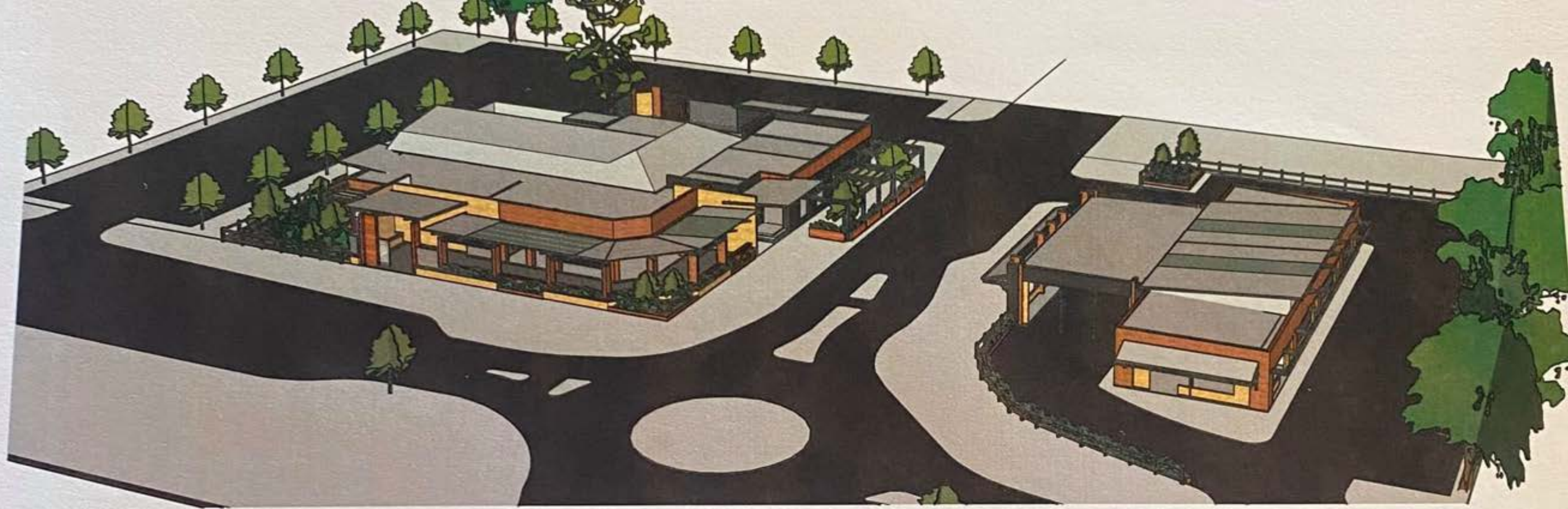
LOOKING NORTH WEST